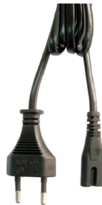
Cord Cable UL, VDE, SAA, CH, BS