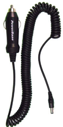
Cigarette Lighter Adaptor 12V / DC