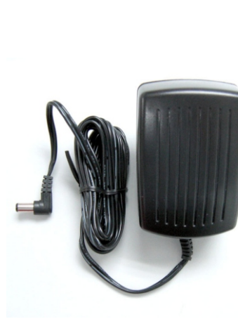
Switching power supply SAA, UL, VDE, CH, BS