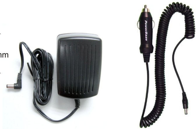
Switching power supply