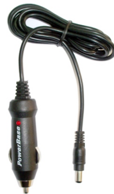
Cigarette Lighter Adaptor